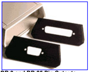
DB 9 and DB 25 Pin Cutouts