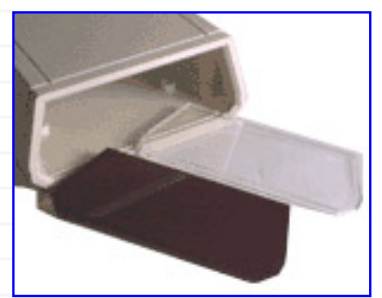
Clear & Infrared Faceplates