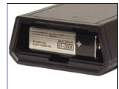
9V Battery Compartment