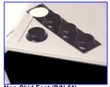
Non-Skid Feet (P/N 51)

Home | About SERPAC | Products | Accessories | Customizations | Distributors | Buy Now! | Contact Us PRODUCTS: A-Series | C-Series | CA-Series | CH-Series | G-Series | H-Series | M-Series | R-Series | S-Series | SL-Series © 2004, SERPAC Electronic Enclosures. All Rights Reserved